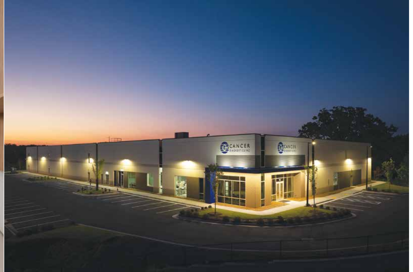
Cancer Diagnostics, Inc., Durham NC USA

Antibodies (alphabetical) pg. 1-64 IHC Control Slides pg. 65-68