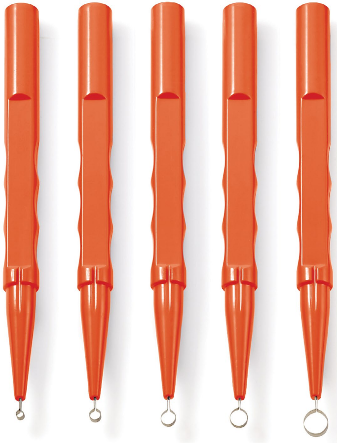
○ 2.0 mm ○ 3.0 mm ○ 4.0 mm ○ 5.0 mm ○ 7.0 mm