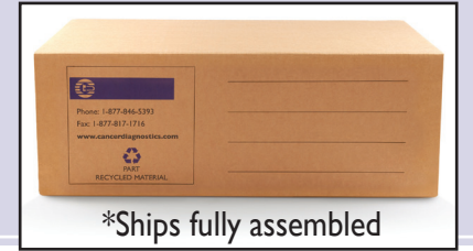
*Ships fully assembled