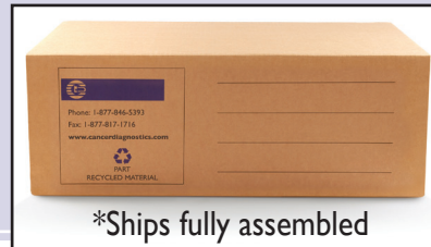
*Ships fully assembled